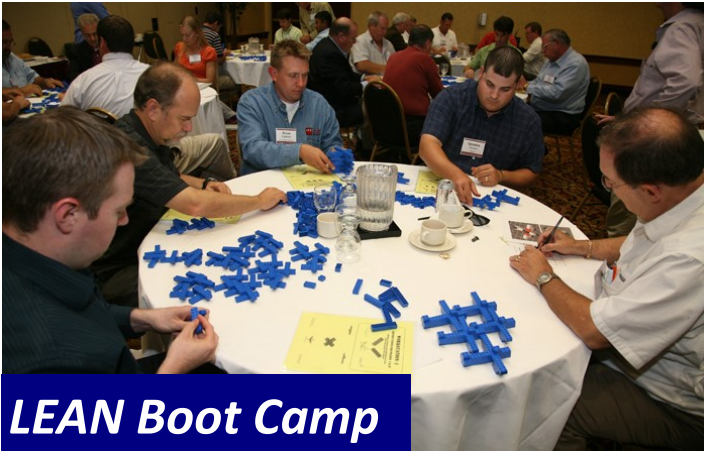
LEAN Boot Camp