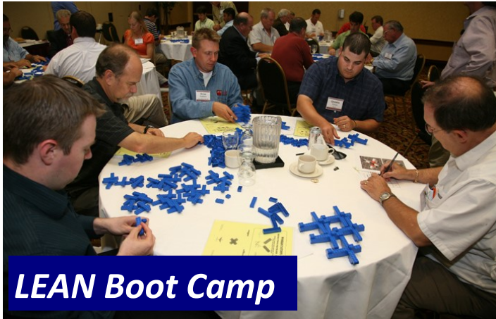
LEAN Boot Camp

HANDS-ON APPLICATION OF ESSENTIAL LEAN PRINCIPLES